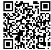
Amazon Wish List