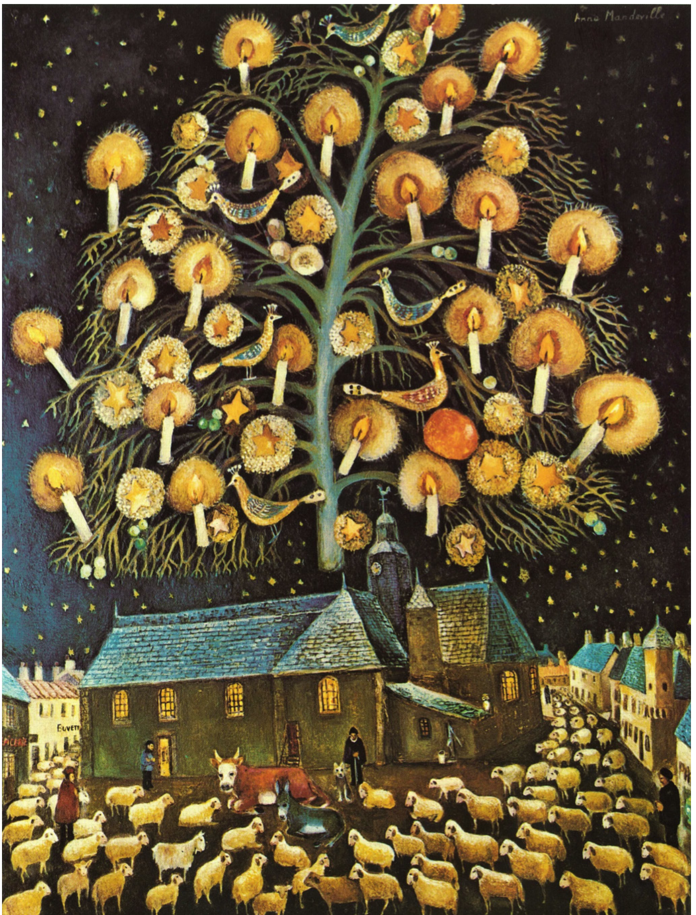
Solemn Holy Eucharist & Blessing of the Crèche December 24, 2022 at 10:30 PM Christ Church + Greenville, South Carolina