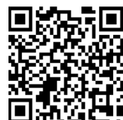
Amazon Wish List